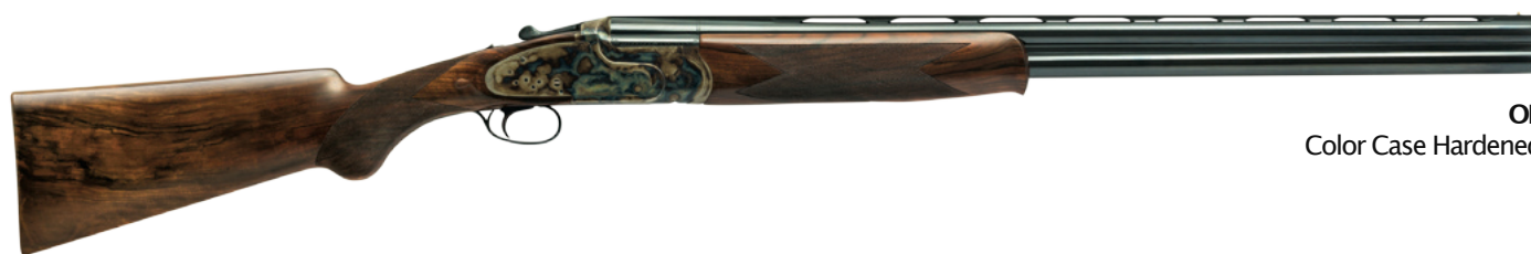
OL Color Case Hardened