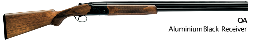
OA Aluminium Black Receiver