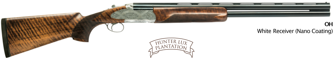
OH White Receiver (Nano Coating)