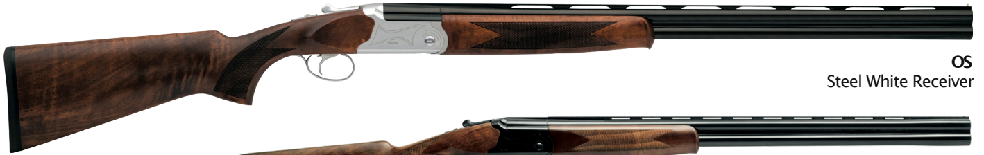
OS Steel White Receiver