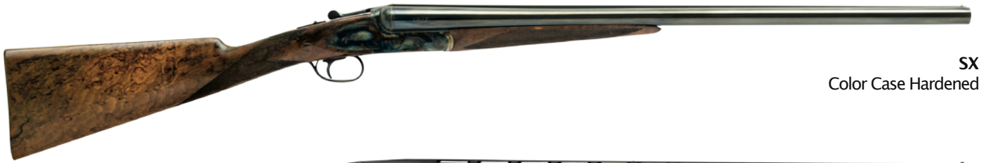
SX Color Case Hardened