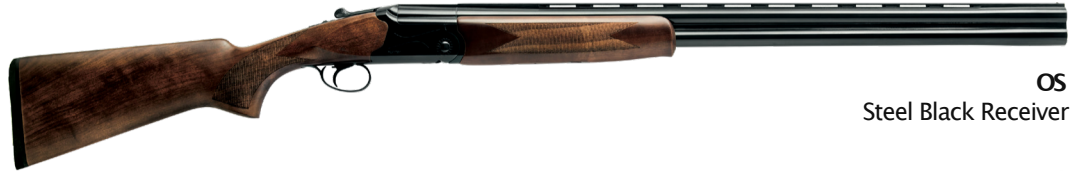
OS Steel Black Receiver