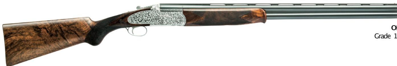
OL Grade 10