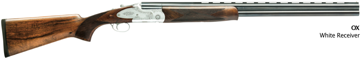
OX White Receiver