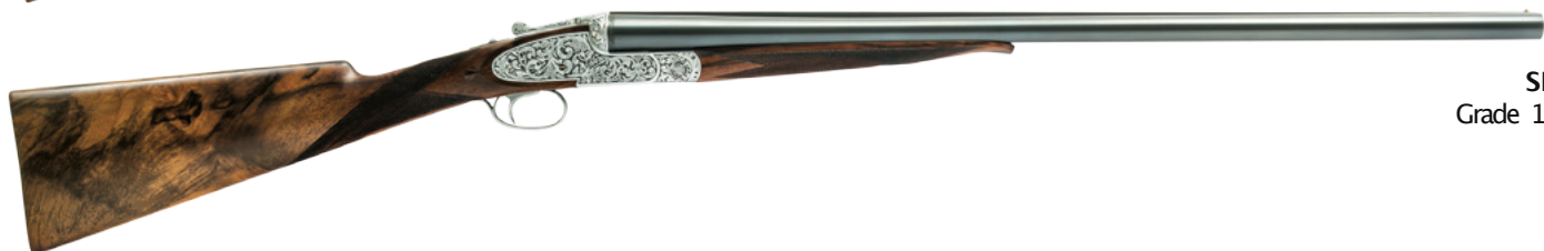
SL Grade 10