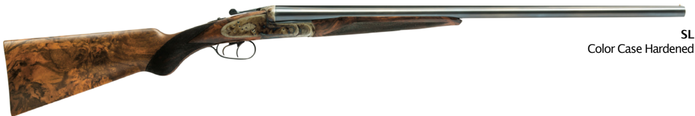
SL Color Case Hardened