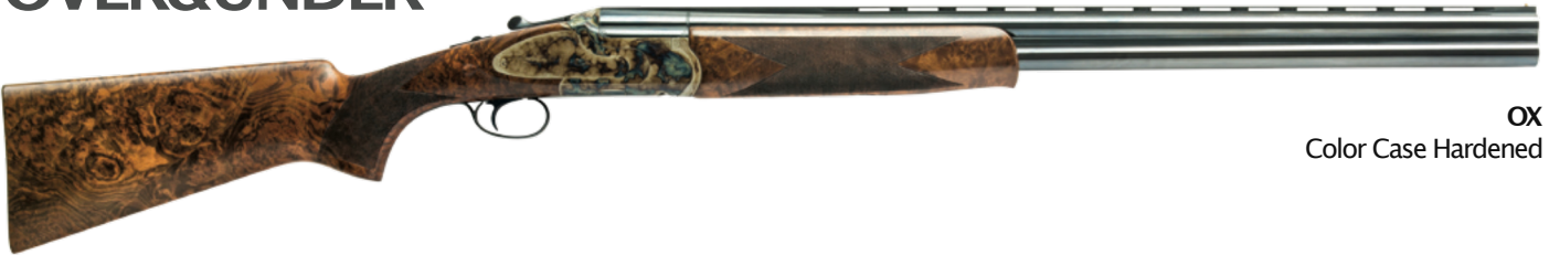
OX Color Case Hardened